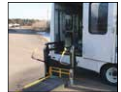
Rear Wheel Chair Lift