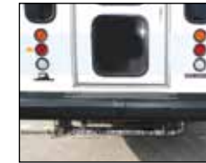
Rear Romeo Rim Bumper