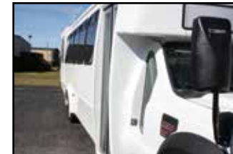
High Gloss Exterior Fiberglass