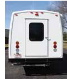
Rear Wall (shown with optional rear door & center brake light)

Due to constant product improvements; specifications, component parts and optional equipment are subject to change without notice or obligation. See your dealer for details. Photos may show optional equipment.