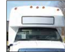
Front Cap with all LED Lighting (shown with optional destination sign)